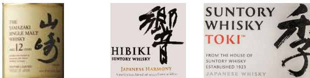
Yamazaki 12 yr Hibiki Harmony Toki