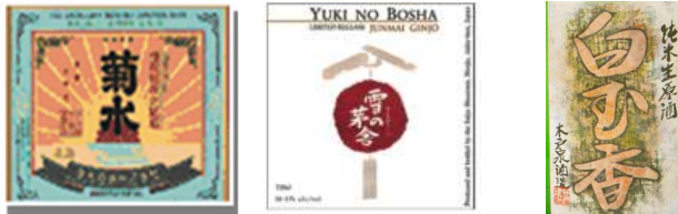
Kikusui “Chrysanthemum Water” Yuki No Boshu “Cabin in the Snow” Kidoizumi Shuzo “Fragrant Jewel”