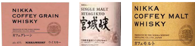
Coffey Grain Miyagikyo Coffey Malt