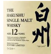
Hakushu 12 yr