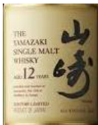
Yamazaki 12 yr