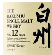
Hakushu 12 yr